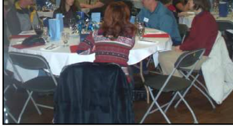
New AEA members discuss questions at the New Member Dinner.

On December 3, AEA welcomed our new members with our third annual, first semester New Member dinner. This year's event was held downtown near the Sunshine mall, next to the Alaska Experience Theater.