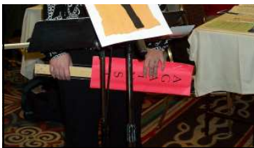
Delegate speaks against an issue at the 2008 Delegate Assembly

Delegate Assembly, however, is an opportunity for general members to come together and shape the policy that guides those decisions. Members write and vote upon new business items that direct the association to accomplish a wide variety of tasks, such as the statewide advertising campaign that is just getting under way. Members